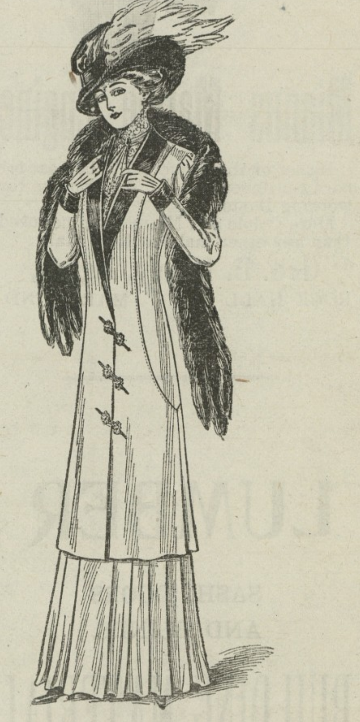
McCall Patterns No. 3083, COAT. No. 3081, SKIRT

Stone-gray broadcloth with gray-blue velvet collar and cuffs, and passermenterie ornaments of gray-blue silk cord for closing. The newest coat models are to be found among the McCall designs. On sale at our Pattern Department.