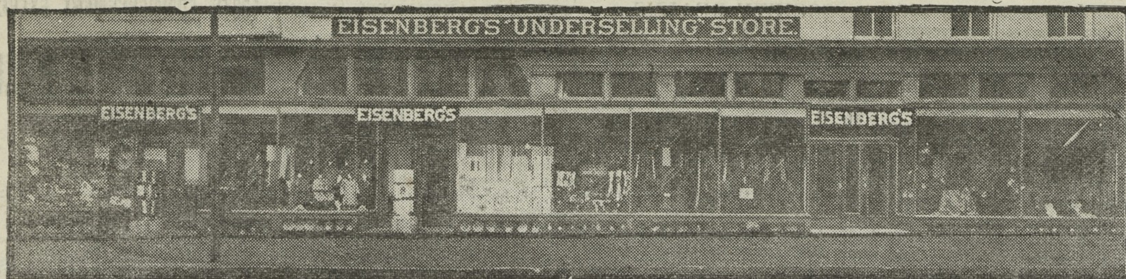
Eisenberg's "Underselling" Store of Baltimore.

There are many reasons why the Eisenberg Store can undersell, that is, sell "the same goods at lower prices." Among these reasons are: 1--Selling strictly for cash; 2--Giving no discounts to a favored class--but treating all alike; 3--Buying for cash from wholesalers and getting the benefit of discounted bills; 4--Having no burden of expense for what are known as "trading stamps"; 5--Keeping in close touch with wholesale markets and taking immediate advantage of every trade condition that forces prices down; 6--Dealing with manufacturers and saving middlemen's profit; 7--Employing the shrewdest merchandise