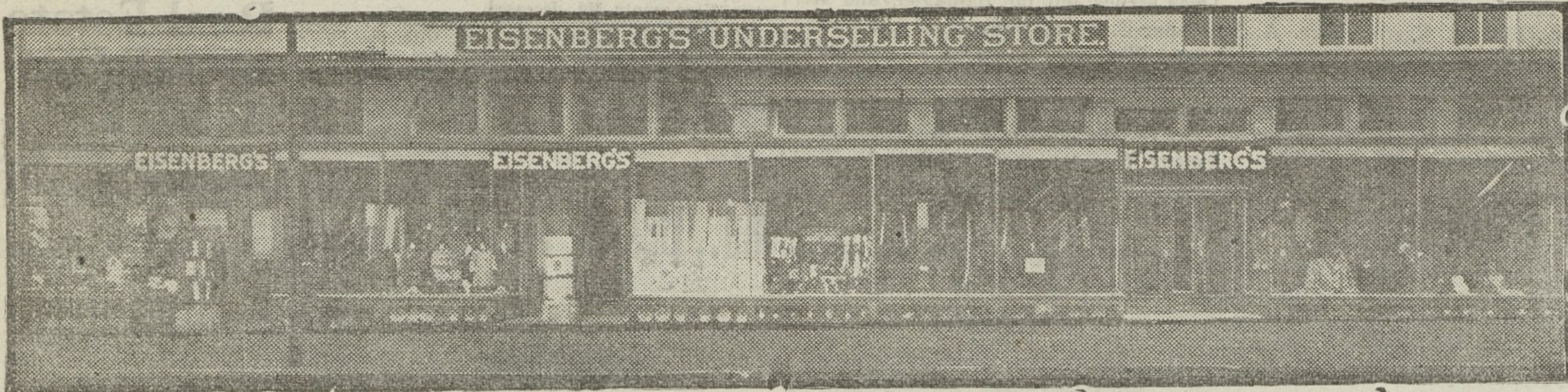
Eisenberg's "Underselling" Store of Baltimore.

Every July the Eisenberg Store holds big sales of every kind of Summer Goods at greatly reduced prices.