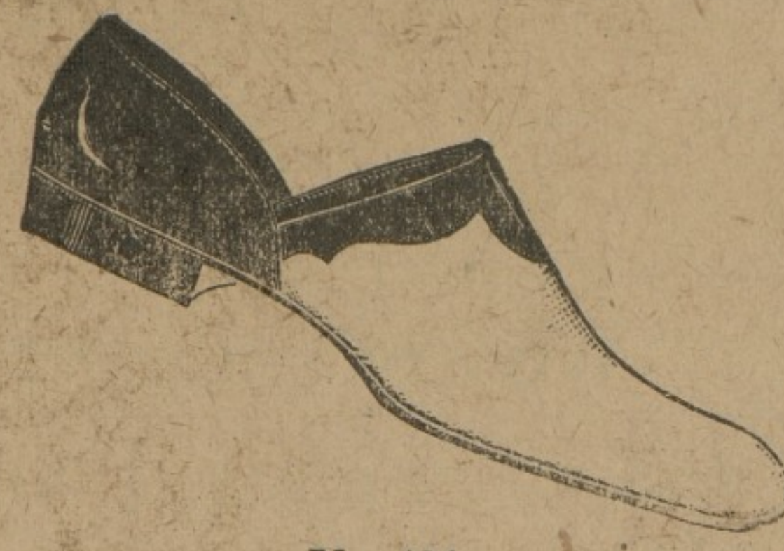
No. 434 Russet Opera, $1.50