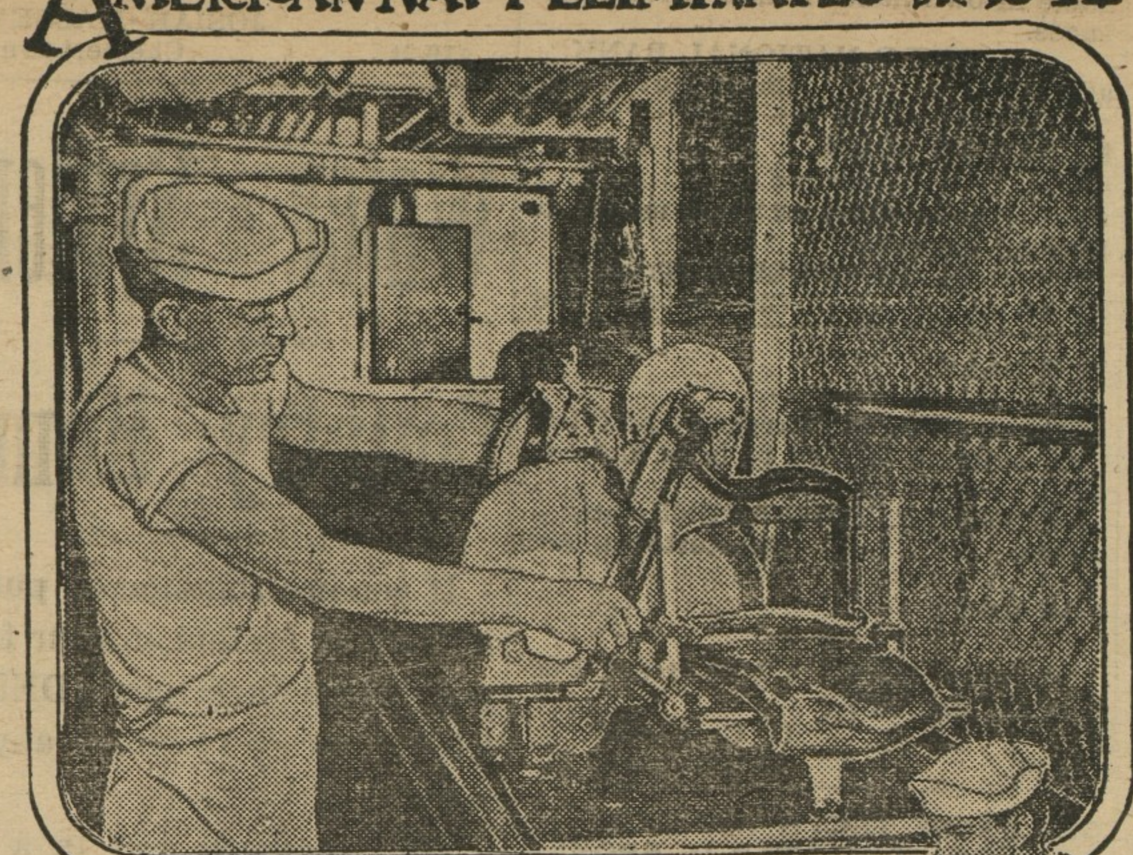
SLICING BACON ON BATTLESHIP

ACKIES in the American navy are classed as the best fed body of men in the world. In the ship's galleys every effort is made to eliminate waste. In the upper photo one of the cooks on the North Dakota is operating a meat slicer that cuts bacon with the least possible wastage. Fat is fuel for fighters. Bacon is badly needed in the allied armies and navies. The allied needs in pork products are 150,000,000 pounds monthly, three times as much as before the war. Another waste eliminator on the North Dakota is the potato peeler, shown in the lower photo. Nothing is lost except the actual potato skin. There is a sufficient quantity of potatoes in America for greater use in every home and for all needs of army and navy. Eat more potatoes, eat less wheat.