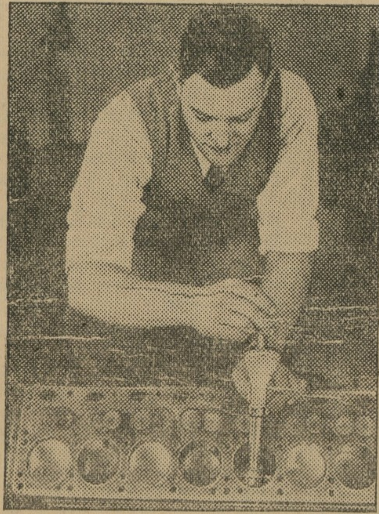
Measuring cylinder wear with a precision gauge—accurate to a hundred-thousandth of an inch!

*Motorists who know these facts will save money: