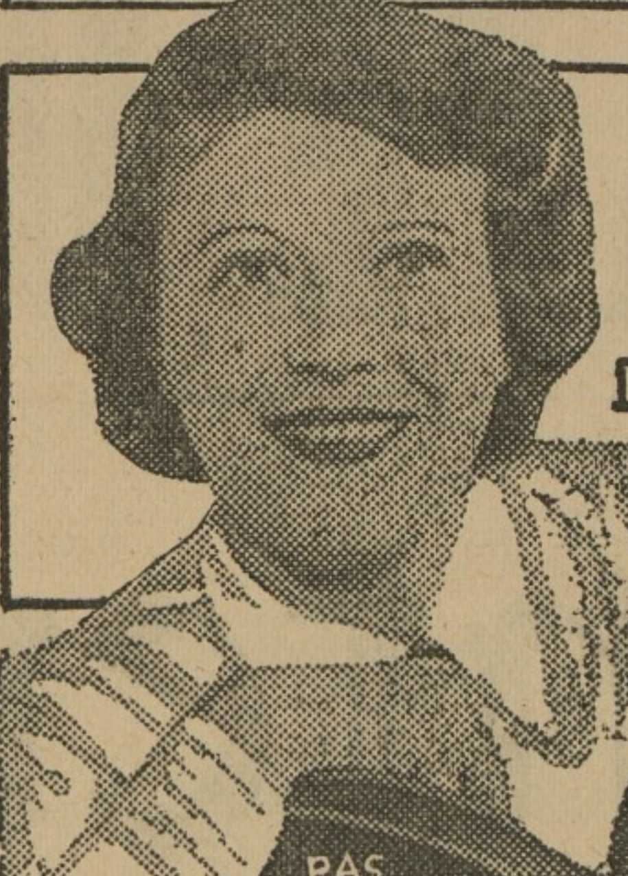
LOS ANGELES... Ruth Cherterton, screen actress, became so air minded that she bought an airplane and flew it here from New York. She is the first ranking screen star to pilot a plane across the country.

Kite flying from the decks of steamers promises to become a recreational feature of Pacific coastwise trips.