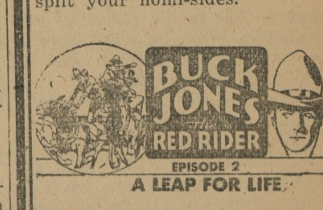
Cartoon, Comedy and Spice of Life.

FRIDAY and SATURDAY JANUARY 18 and 19 "Lightning Strikes Twice" with Ben Lyon Thelma Todd Pert Kelton Laura Crews "Skeets" Gallagher Walter Catlett Chick Chandler Seven Giggle Stars in a wilder story of murder that will split your homi-sides.