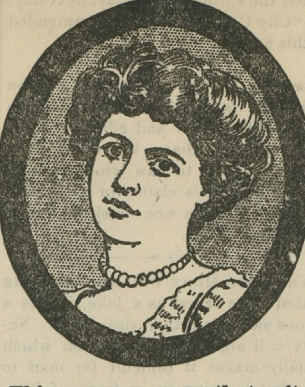
This woman says that after months of suffering Lydia E. Pinkham's Vegetable Compound made her as well as ever.

It is a pity to see a person neglect indications of kidney or bladder trouble that may result in bright's disease when Foley's Kidney Remedy will correct irregularities and strengthen those organs. Take Foley's Kidney Remedy at the first sign of danger. For sale by all druggists.