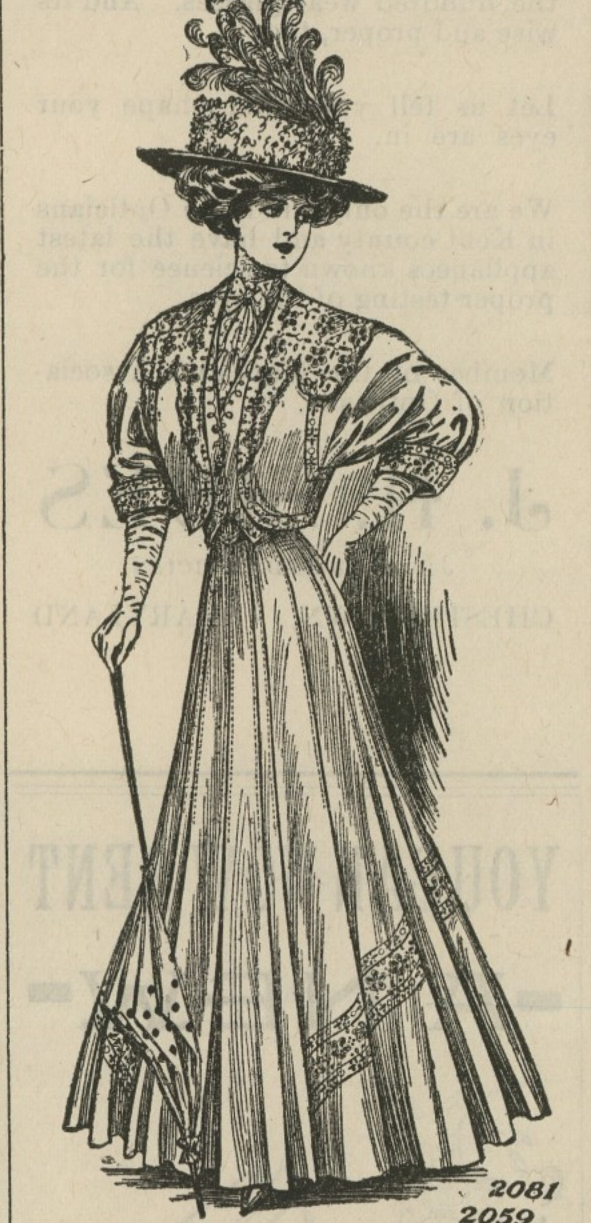
The above design is by the McCall Co. of New York. Publishers and Manufacturers of McCall Patterns.

These have lost neither beauty nor prestige. Long lines of tucks or other garnitures from the throat to the edge of the skirt preserve the Princess effect. Last season's materials are in full force supplemented by inserts of flit or Irish lace. Wearing collars beneath a white dress conveys the effect of several different dresses—a feminine subterfuge, but nevertheless a useful one. Blue, pink or heliotrope lingerie dresses suit a pale complexion better than white, and are therefore well patronized.