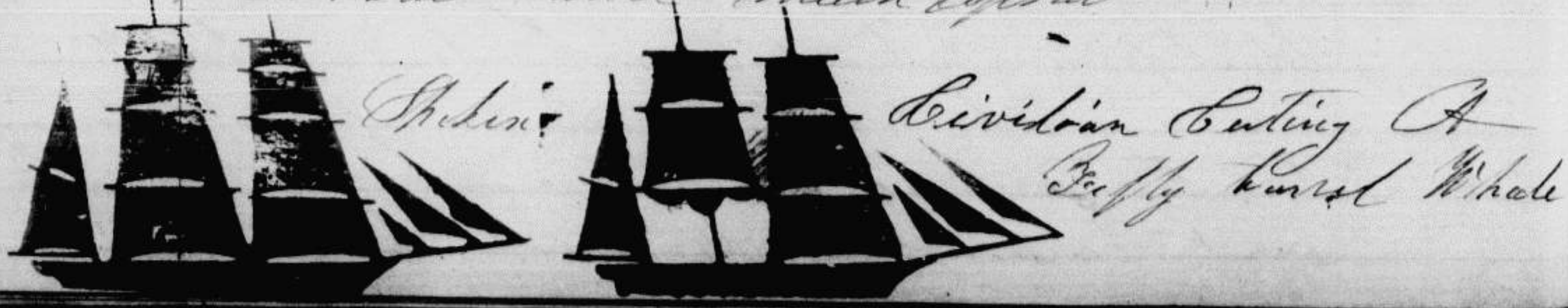
Ships Civilian Cutting A Cuffy Barrel Whale

Commenced with fine bears from south south east and good weather buff up by the wind to the eastward saw a Merchant vessel to the windward saw a Barge ahead of us eating A Whale at sundown took in the Mizen and main topsail